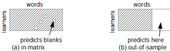
Figure 1: Two problem settings; (a) in-matrix, (b) out-of-sample.